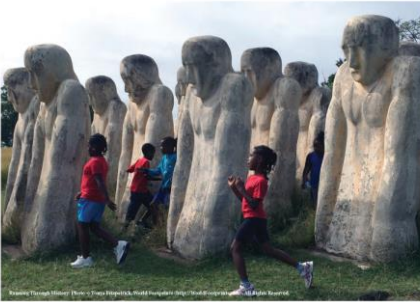
Week of Prayer for Christian Unity 2018

Saturday 20 January Churches Together Breakfast